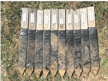
The first samples failed after 8 years